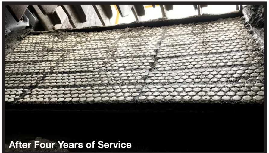
After Four Years of Service

For assistance with your application, call Richwood (304) 525-5436.