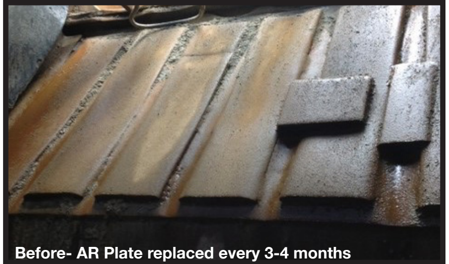
Before- AR Plate replaced every 3-4 months

The AR plate required extensive amounts of cutting and welding to install and repair.